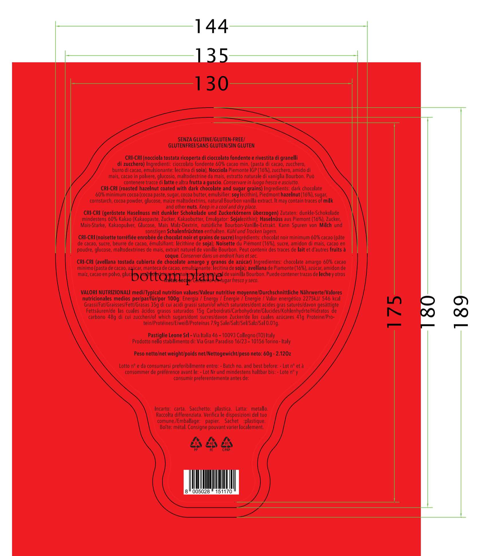
layout drawing of bottom