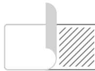
BOTTOM LAYER Stran 3 / Page 3