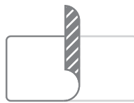
INNER LAYER Stran 2 / Page 2